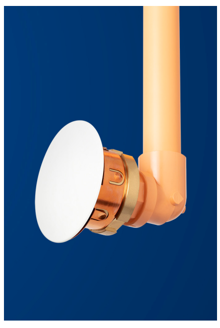
DO NOT use thread tape or sealant