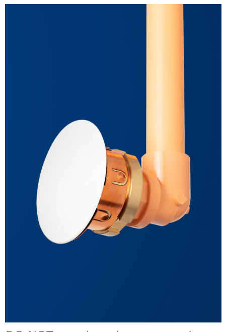
DO NOT use thread tape or sealant