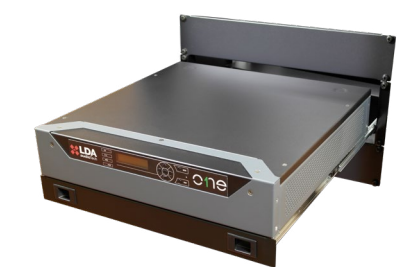
Rack Mounting ONE-RMA EN 54 certífied

EN 54 expansion unit for VAP-1 with 8 programmable zone buttons.